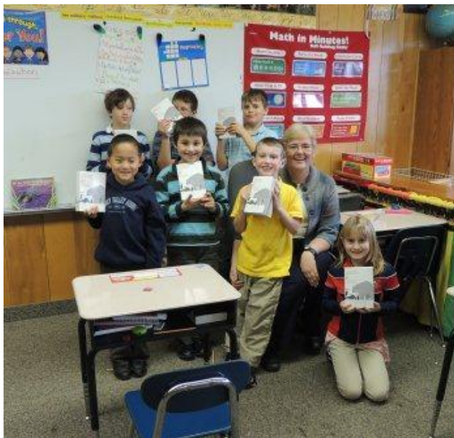
The third grade class at the Lima Christian School

We also handed out thesaurus books to the 6 th grade classes at the HF-I Middle School and the LCS.