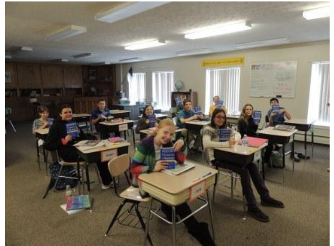
The 6 th grade class at Lima Christian School

We also handed out thesaurus books to the 6 th grade classes at the HF-I Middle School and the LCS.