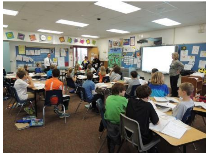
A 6 th grade class at the Honeoye Falls-Lima Middle School