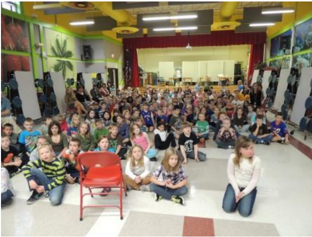
A third grade class at the HF-L Manor School

Our Club also in the past couple of weeks handed out dictionaries to the third graders at the Honeoye Falls- Lima Manor School and the Lima Christian School.