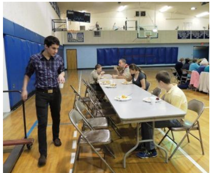
Some of the servers who helped us make this dinner a success.