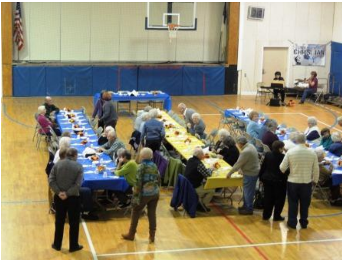
As the senior citizens start to arrive they are enjoying being able to talk with each other