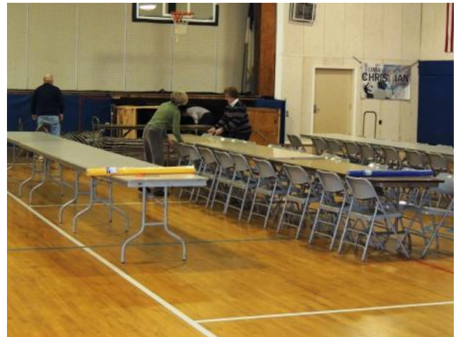
Preparing the tables for our senior citizens