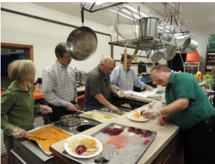
The kitchen staff getting the meals ready to serve