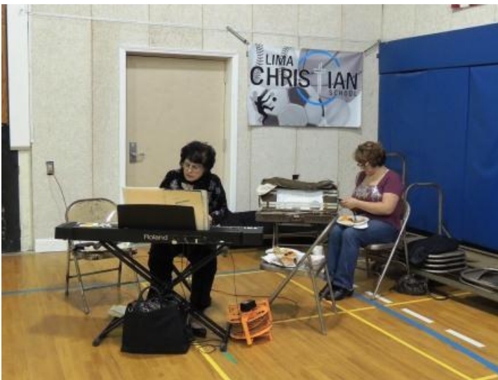
The entertainment for our guests