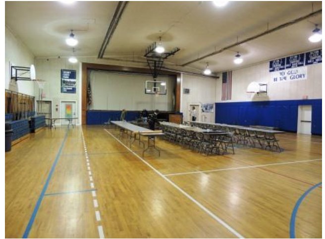
The set up of tables and chairs for the dinner

On Saturday Nov. 17 th we held our annual Thanksgiving Dinner for the Senior Citizens of our community. The following pictures will show you some of what was happening for us to put on this dinner.