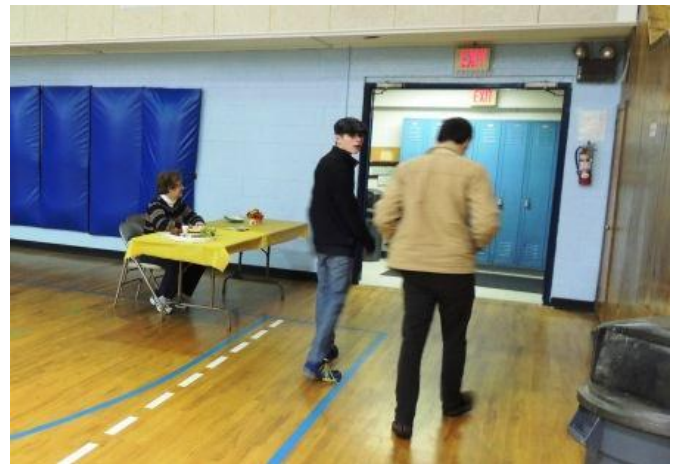
Getting ready for the senior citizens to arrive