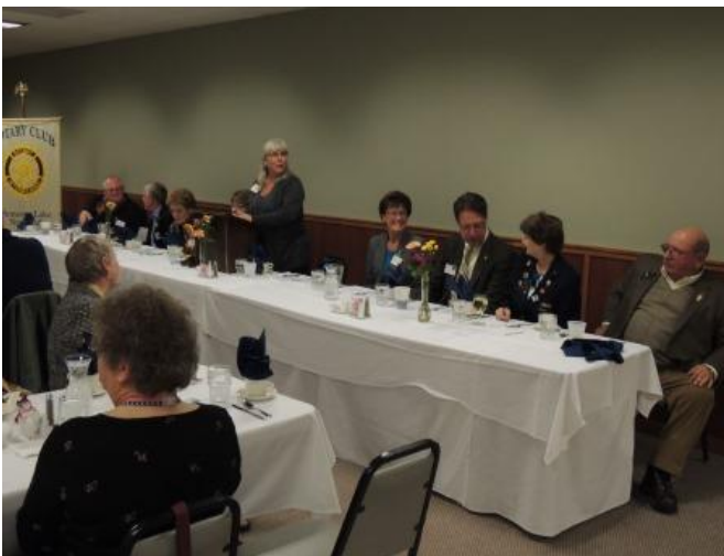
Head table for the Quad Cities Dinner