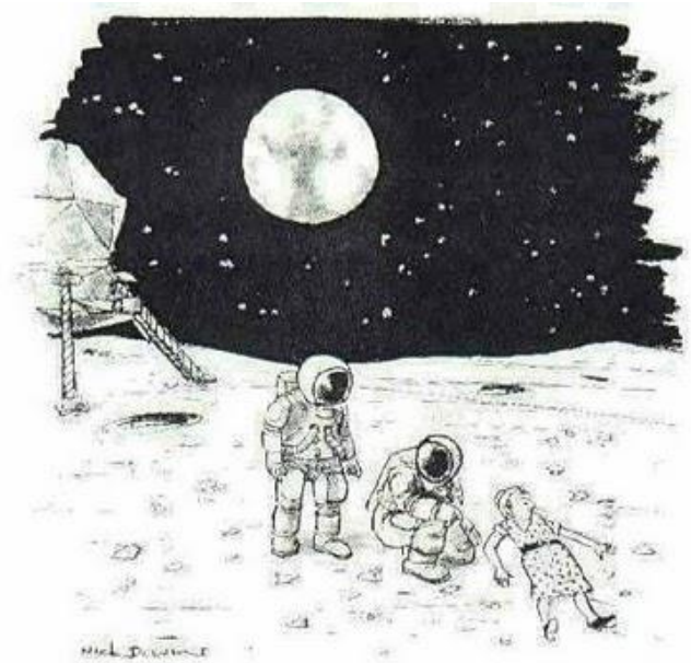
"It's Alice Kramden!"