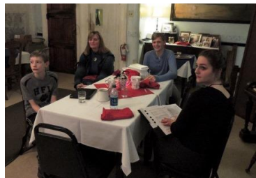
The Hargrave family

Fines: No fines were given out this evening due to celebrating Valentine's Day with our family and friends.